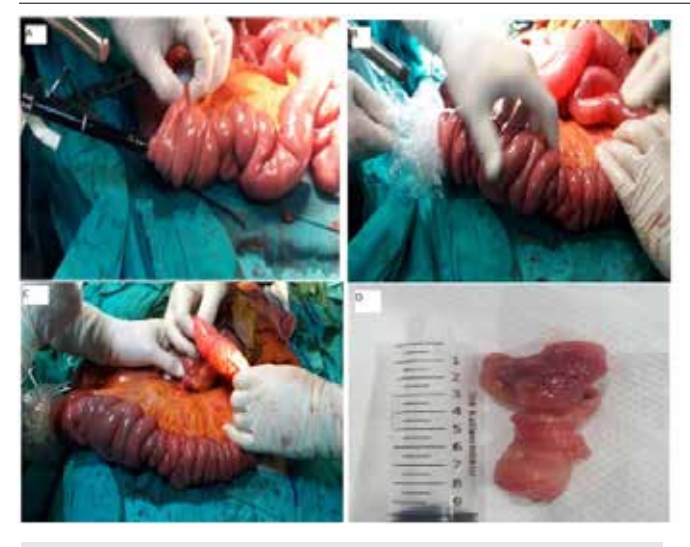
Figure 1. (a, b, c, d) : Performing polypectomy with the help of snare entering via enterotomy through gastroscopy in a case with Peutz-Jeghers syndrome (Table 1, Case 6).